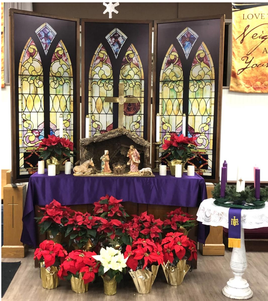
The Church was decked out for Christmas. Many thanks to all who donated for poinsettias and vigil candles in memory of loved ones. The candlelight service on Christmas Eve was a lovely event.