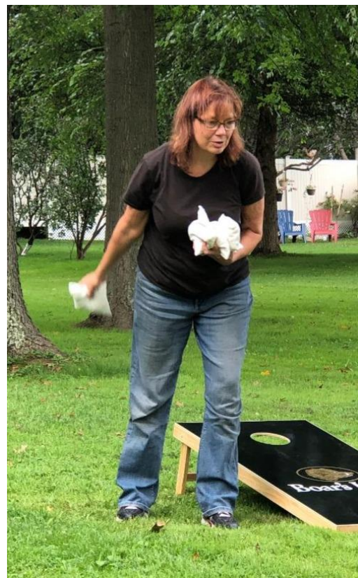
Fun and Games Afternoon 2023