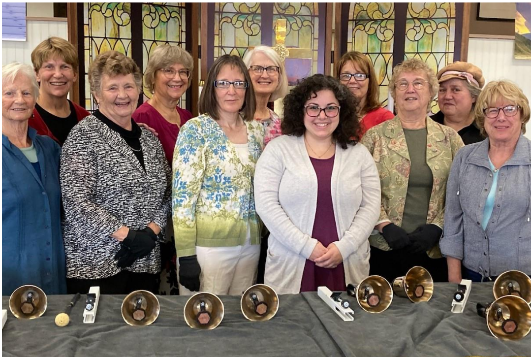
Rutland UMC's Bells of Joy