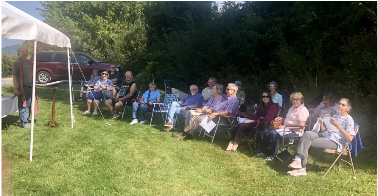
Outdoor Worship 2024