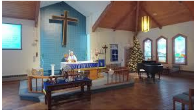
Good Shepherd Lutheran Church